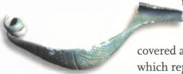
Early Iron Age bronze brooch

The most important part of the archaeological remains is located 160–200 cm beneath the modern ground surface. A considerable amount of daub and prehistoric potsherds was discovered at this level, as well as a 16-m-long stone setting, which represented a house foundation wall. Numerous daub fragments with wattle imprints, animal bones and potsherds lay alongside the wall. The building was destroyed by fire. A further, circular building (3.80 m in