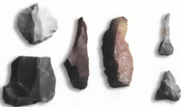
Eneolithic stone tools and flakes